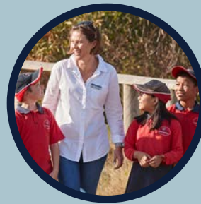
Build skills through fun