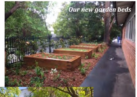
Our new garden beds