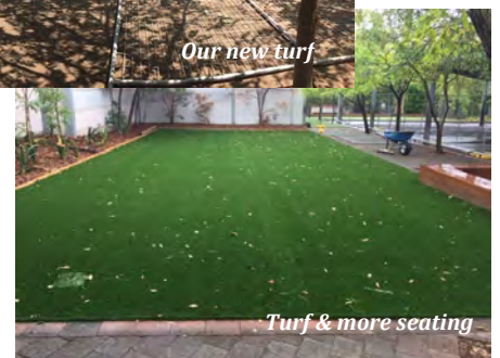
Turf & more seating