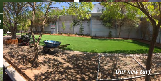
Our new turf