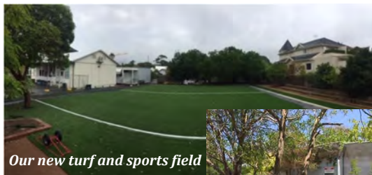
Our new turf and sports field

Our playground upgrade continues. We love our new garden area on Wilberforce Avenue. Our new turf has been laid and looks fantastic and ready for use. Thank you for your flexibility with the new roof replacement. We will continue to keep you updated on its progress.