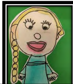
Gabby Get Along