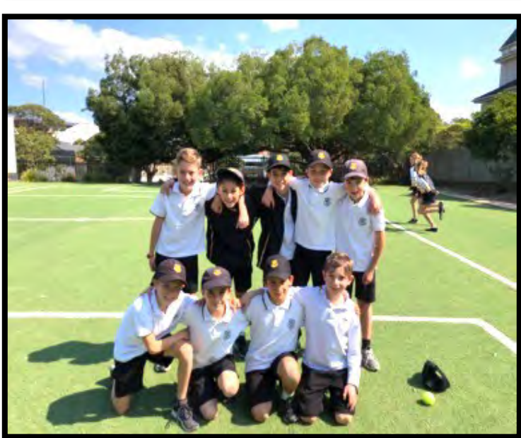
"I enjoyed playing PSSA soccer. My team played their best. We came 2nd out of 16 teams!"