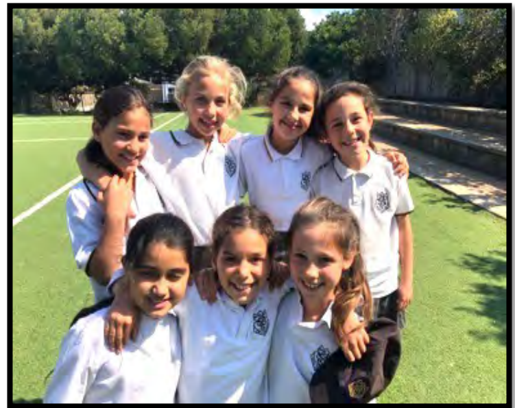
Congratulations to all PSSA players.

Your commitment to training and playing each week shows how hardworking and dedicated you are to achieving your sporting goals. Coaches noticed improved teamwork and game skills every week. Well done!