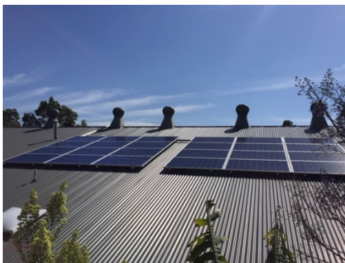
Solar cells in action and providing a real time learning solution