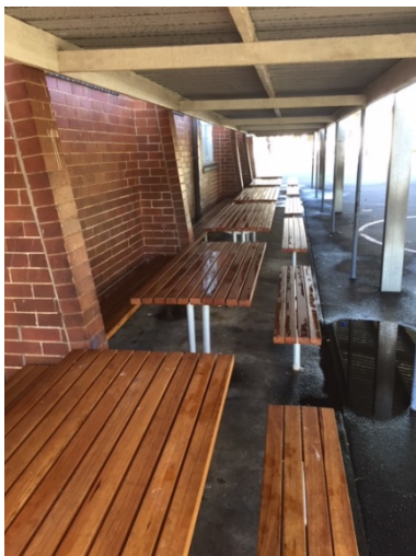
Covered seating utilised for a variety of purposes

Have you seen the new seating outside kindergarten rooms? These seats provide a shaded space for eating, a quiet space for children to connect with others during break times, and the flexibility to be used as an outdoor learning area.