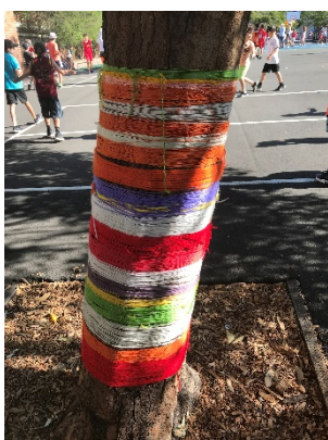
A 'harmonious' playground

Our new smart boards have been installed. Rose Bay Public School has an excellent reputation for its technology programs that enhance learning outcomes for all students. The purchase and installation of these whiteboards was made possible with support from the P&C. Whiteboards promote creativity through design and experimentation, collaboration, communication, critical thinking and engagement.