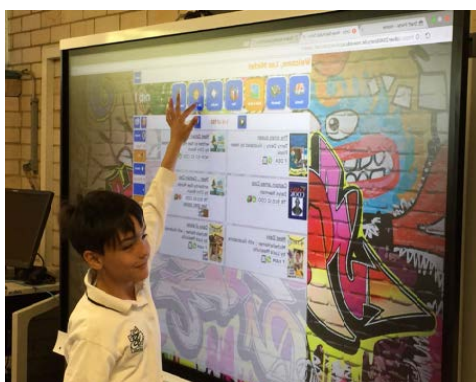
Whiteboards promote creativity