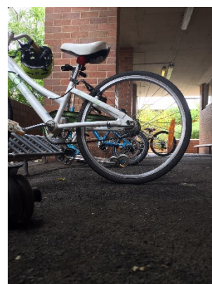
Our much loved bike racks clearly getting a workout