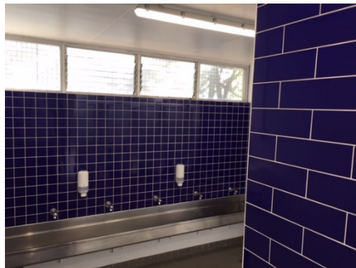
Colourful tiling has improved bathroom presentation