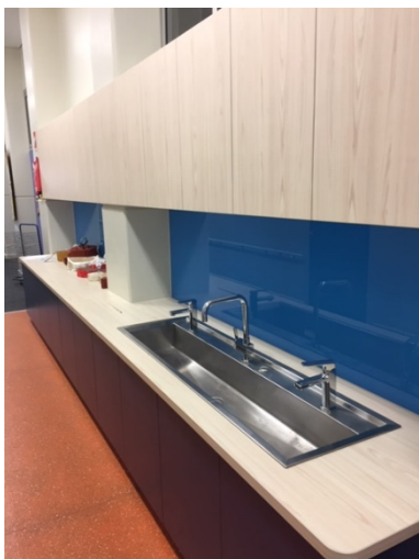
Newly installed wet area and storage

Our school hall now hosts solar panels. A successful grant application made this project possible. Not only do these panels assist in reducing the school's environmental impact and our overall electricity bill, but they are also a valuable teaching resource. The system will help us power our learning facilities with renewable energy; cut 20% off our annual energy bill; produce clean green energy equal to powering 209 school computers each year; and avoid 37 tonnes of greenhouse gas emissions - like taking 13 cars off the road each year. Take a look next time you are passing the hall.