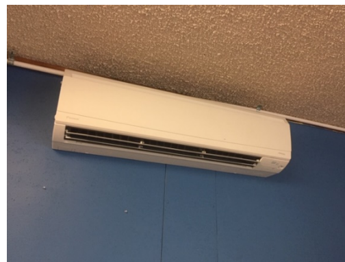
Air conditioning helping to cool classrooms