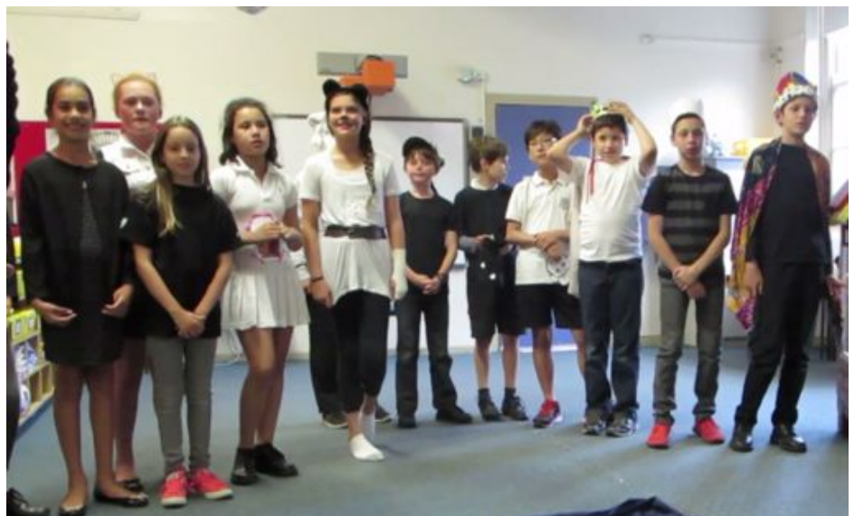
Final curtain call!

The moon cannot fall into the water, my friends. The moon is up there in the sky all the time !