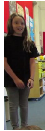
The three narrators

Help, help ! The moon has fallen into the water !