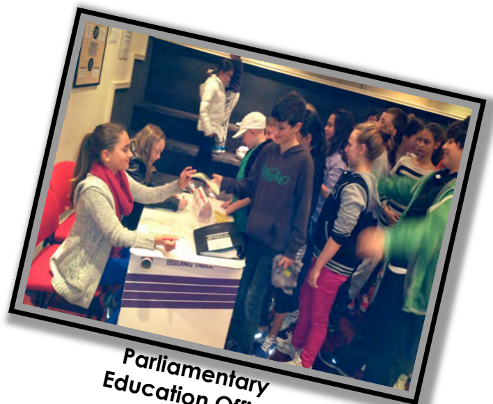
Parliamentary Education Office