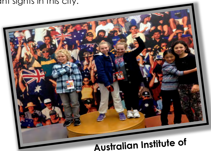
Australian Institute of Sport