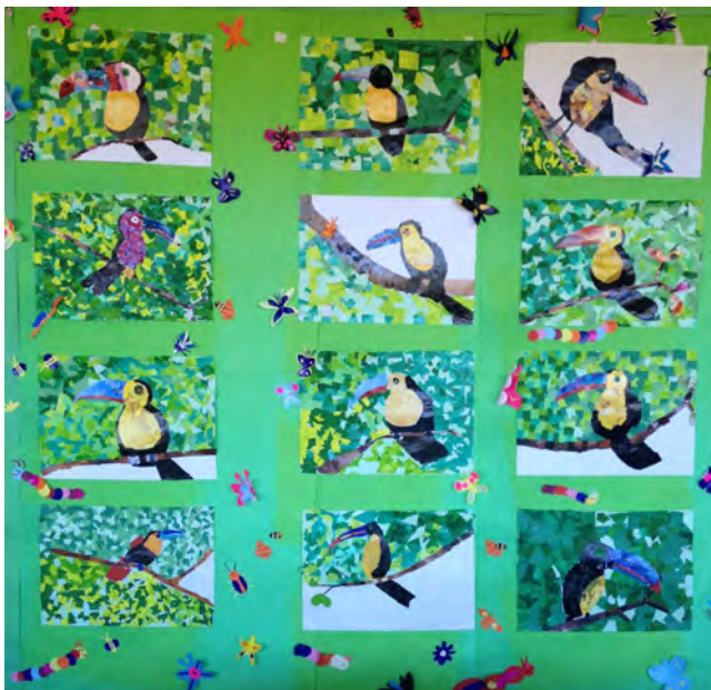
Amazon Rainforest Toucans by 5K.